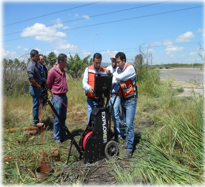
Municipal Well - Mexico