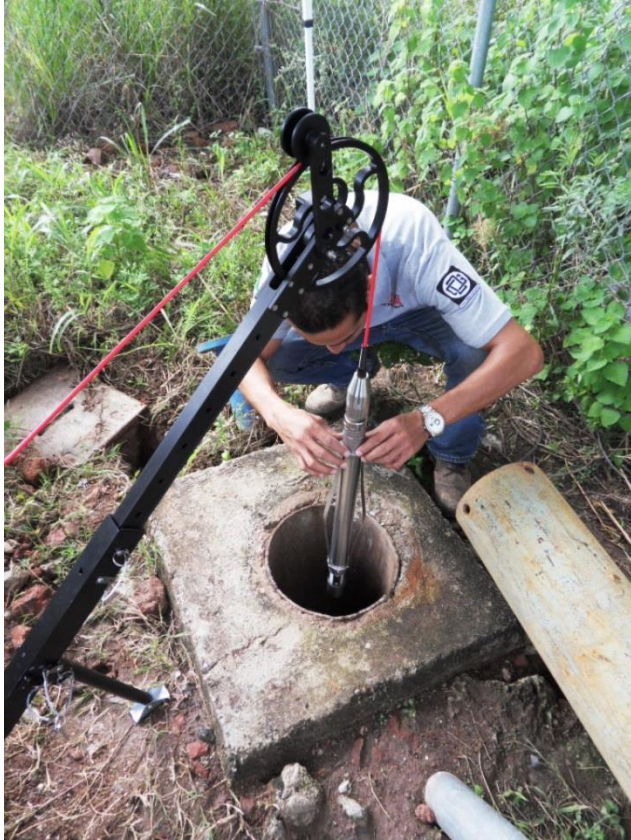
Residential Well - Mexico