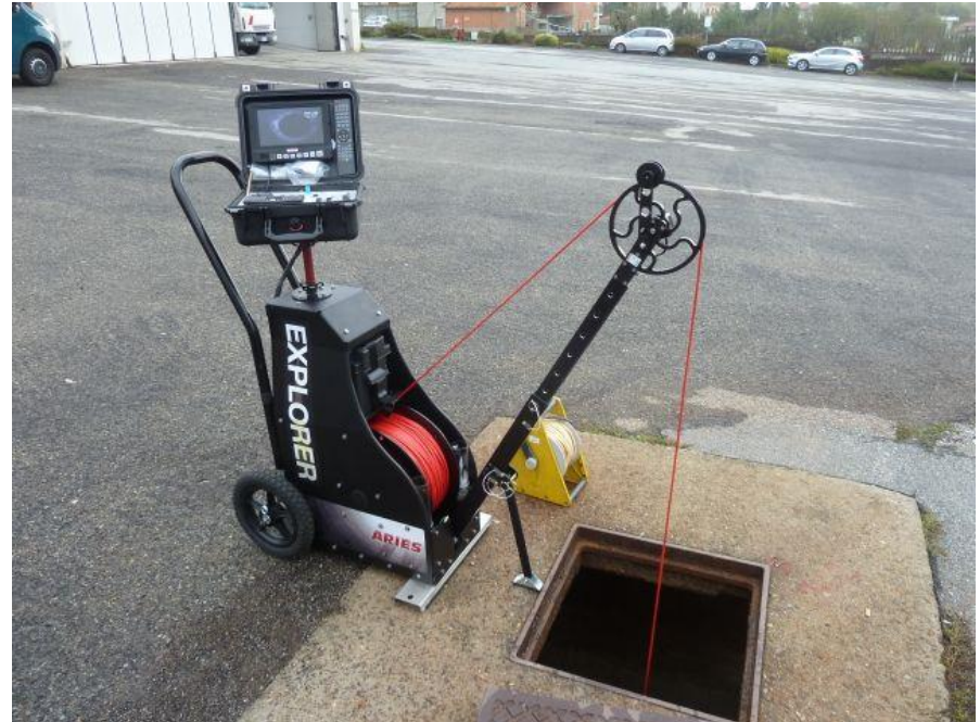
Industrial Well - Italy