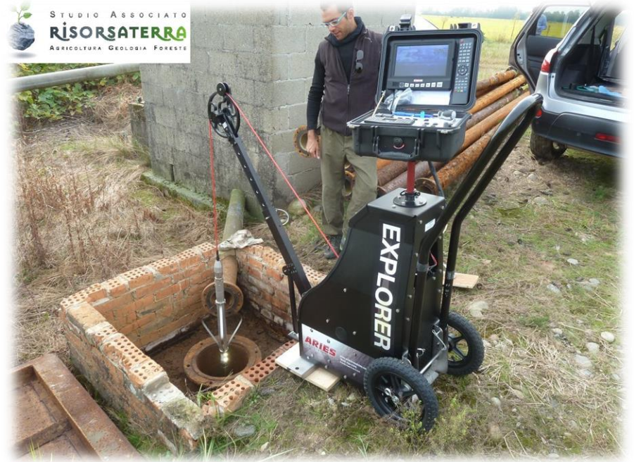
Agricultural Well - Italy